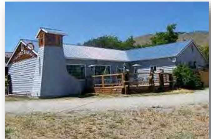
Entiat Valley Community Services