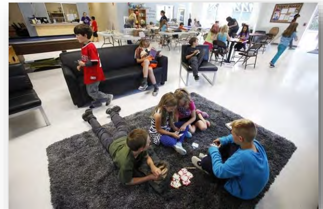
Sultan Boys & Girls Club