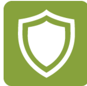
Safety / Crime Victims