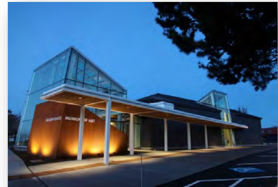
San Juan Islands Museum of Art