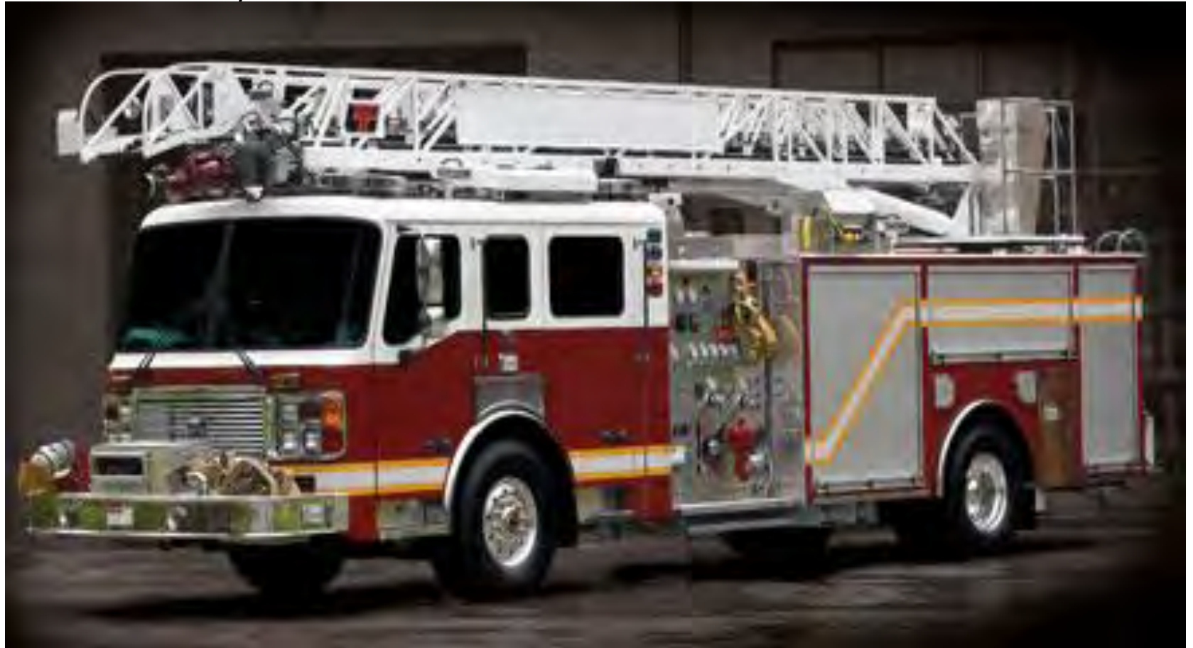
Sedro Wooley Ladder Truck