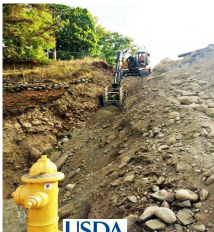
City of Okanogan Water Line Replacement Project