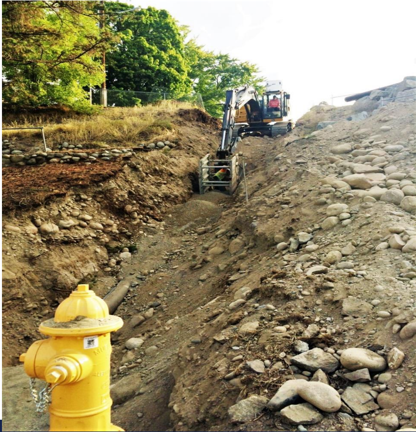
City of Okanogan Water Line Replacement Project