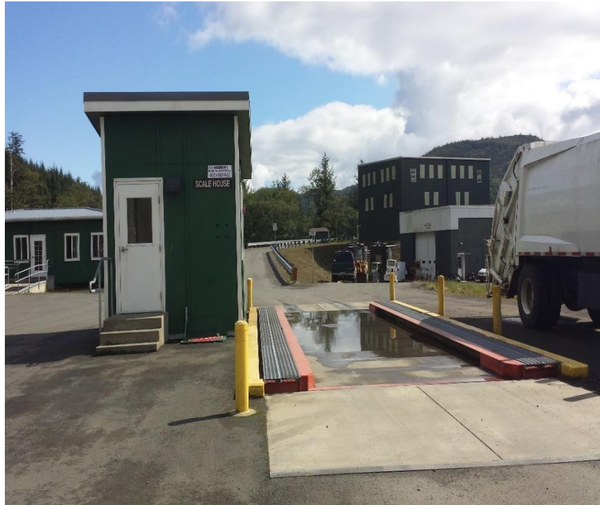
Makah Indian Reservation Transfer Station